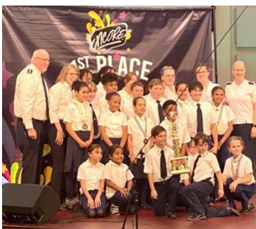
Singing Company 1 st place winners of the 2022 Encore competition.