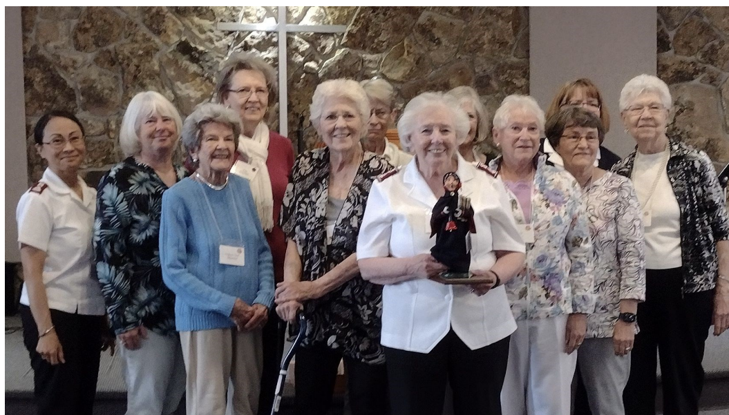
All of the Dolls of the Year in attendance