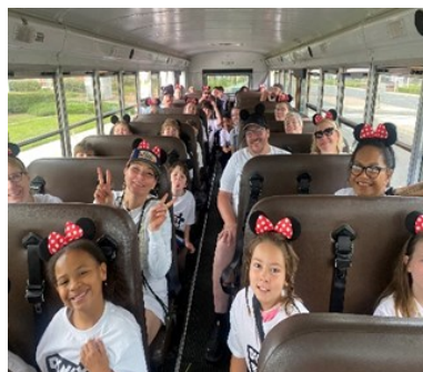
Centennial Thrive Youth surprise field trip to Disneyland (for all their hard work)