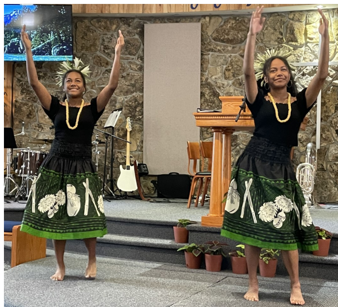
The Vesikula daughters