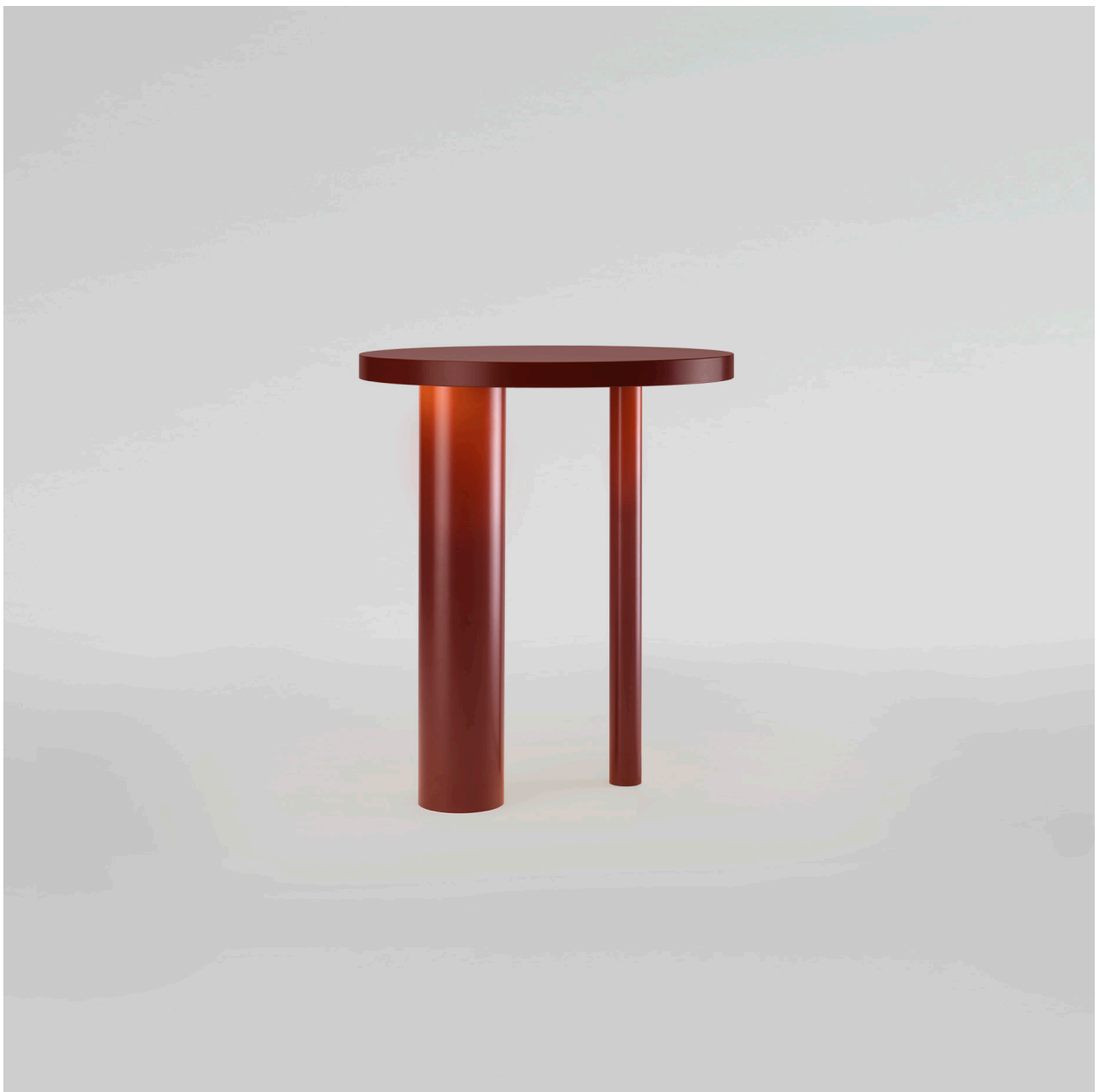
Table Composition, 2017